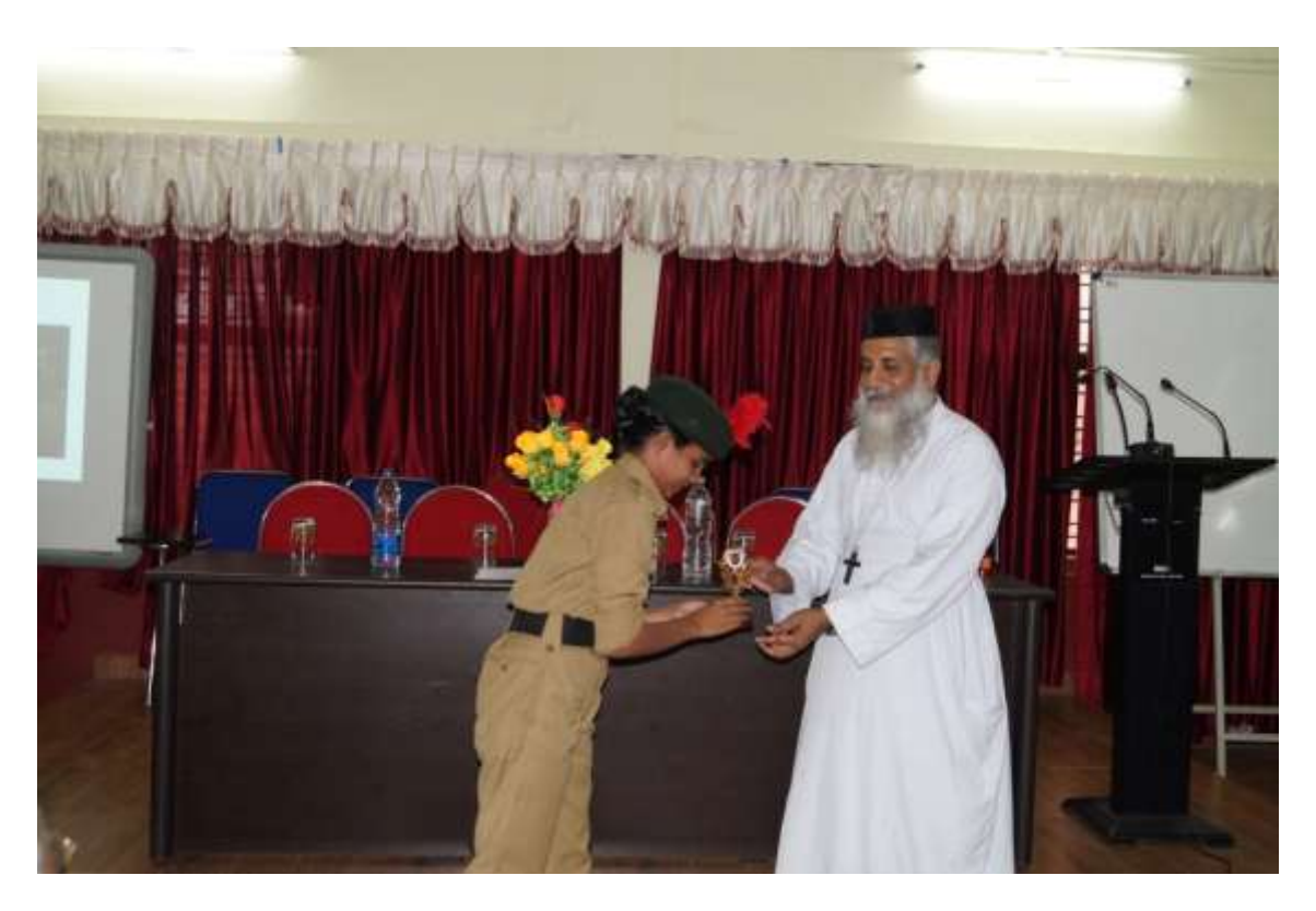
Cadets Enrolled – 2015-16