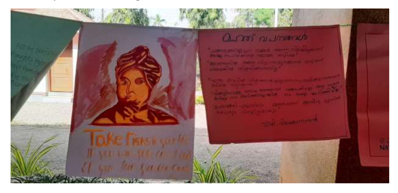
Chart presentations were conducted and a debate on role of youth in protecting democracy were also took place