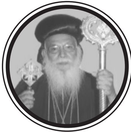
H.H. Moran Mar Baselios Marthoma Didymus I (ValiyaBava)