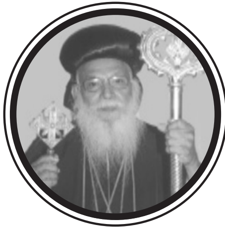
H.H. Moran Mar Baselios Marthoma Didymus I (Valiya Bava)