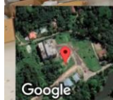
Punalur, Kerala, India 2WR9+RHJ, Punalur, Kerala 689696, India Lat 9.04195° Long 76.919289° 04/11/23 11:45 AM GMT +05:30