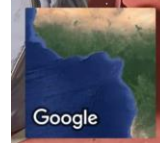
Edamulackal, Kerala, India 2WCH+VF4, Kalayanad, Edamulackal, Punalur, Kerala 691305, India Lat 9.021977° Long 76.929451° 23/08/24 03:19 PM GMT +05:30