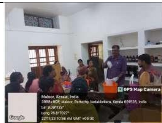
Maloor, Kerala, India 3RR9+9QF, Maloor, Pattazhy Vadakkekara, Kerala 691526, India Lat 9.091123° Long 76.817027° 22/11/23 10:56 AM GMT +05:30