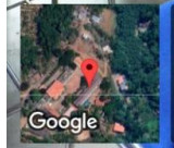
Maloor, Kerala, India 3RR9+J43, Maloor, Pattazhy Vadakkekara, Kerala 691526, India Lat 9.091604° Long 76.817673° 12/10/23 02:50 PM GMT +05:30